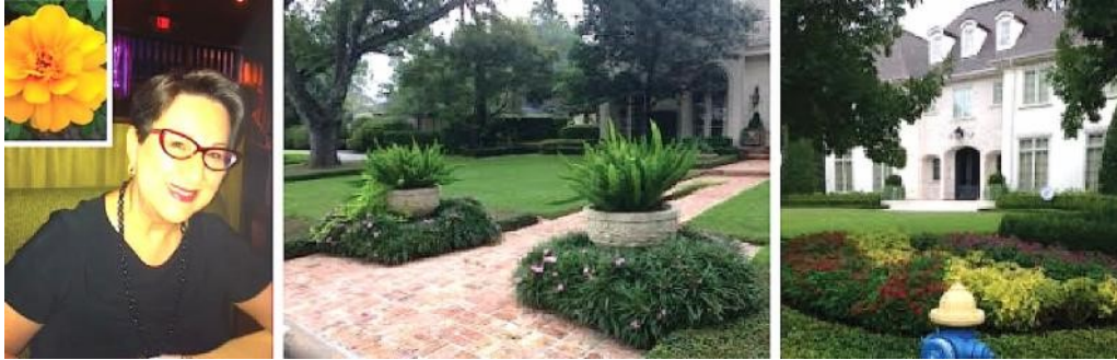
Katherine Ashby, left, above, with a colorful marigold and landscape examples of use of the bagua. Below, the bagua, showing the octagon and the square. The octagon has the colors, elements and body parts on it, and the square one (Three Door Bagua) is the one to overlay on the property, so you have to use both in the article to make sense.