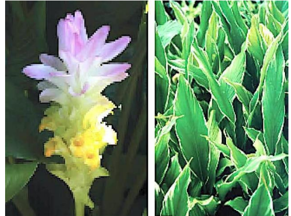
Curcuma petiolate variegata 'Emperor'