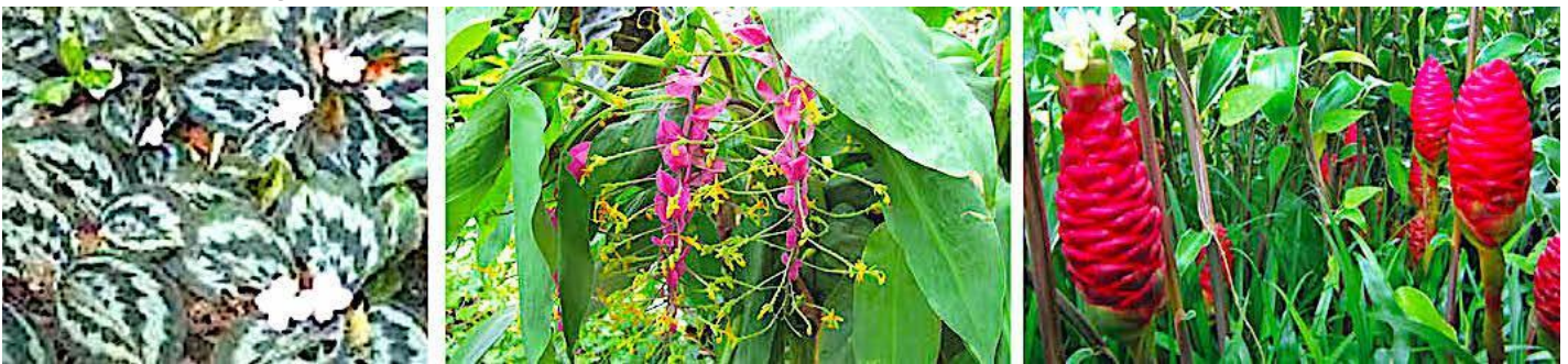
L to r, Kaempferias (Peacock Gingers), Globbas (Dancing Ladies) and Zingibers (Pinecone gingers)

As October nears its end, some gingers like Curcumas (Hidden Gingers), Kaempferias (Peacock Gingers), Globbas (Dancing Ladies) and Zingibers (Pinecone gingers) are falling into dormancy. This means that they literally go to sleep in the winter and wake up in late spring.