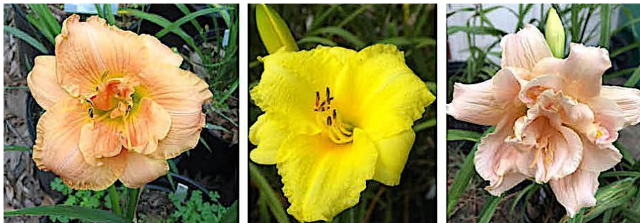
L to r: Hemerocallis 'Autumn Orange Truffle,' H. 'Galadriel' and H. 'Double Soufflé Magic'

October is the prime time in the Houston area to plant daylilies. Plant daylilies now to reestablish a strong root system that will be better able to withstand winter freezes and develop better blooms next spring. Plant them in neutral to slightly acid soil where they will receive at least 6 hours of sunshine. Dark color blooms benefit from a bit of midday shade.