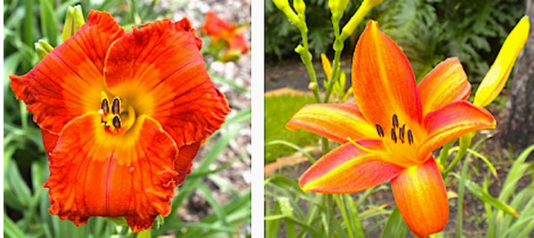
l to r: Hemerocallis 'Everyday Hero' and H. 'Some Pumpkins'