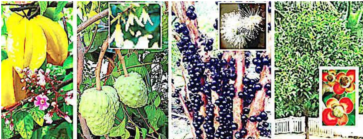
L to r, above: carambola (starfruit), cherimoya (custard apple), and jaboticaba. Below: mangosteen, sapodilla, soursop, and white sapote.

Less common but still doable (l to r below) are the carambola or star fruit, cherimoya or custard apple, jaboticaba, mangosteen, sapodilla, soursop, and white sapote. These fruits are best cultivated in containers and will need protection in winter. This can be a trip to the garage or a wrapping of insulation.