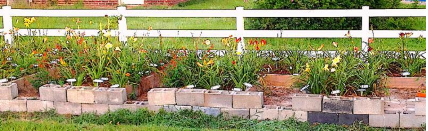
Mary & Eddie Gage's "Smart" raised garden ideal for daylilies