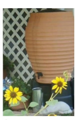
Rain barrels don't have to be unsightly, as these examples from Texas A&M AgriLife, left, and gardener Mel Basham, right, demonstrate. The one at left waters a bog garden and is covered with wooden slats.

Diverting rainwater from your roof into a rain barrel is a smart idea, and it's one that is getting a lot of traction. Rain barrels are readily available but there are some important steps to take to ensure your rain barrel works as effectively as possible.