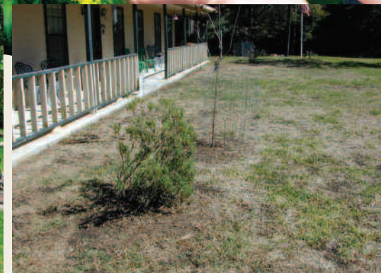
The lawn is healing after applying Nature's Way Resources compost.