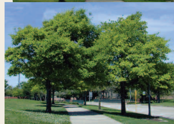
The Oak trees are showing dramatic improvement with new growth all over after 6 months of tree root treatments using Nature's Way Resource compost.